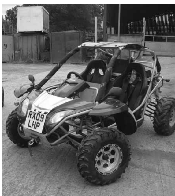
Quadzilla buggy – 550cc Petrol powered – Lot 1056