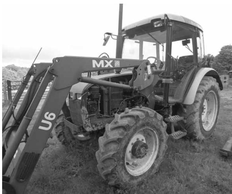
'03 Reg, Zetor 7341 Super Turbo tractor 4WD 3961 hours – Lot 1052

Viz: '07 Reg, BCS 950 Alpine 4x4 tractor – Dual steer front & centre, full cab rotation, Case McCormick Landman 4WD loader tractor LX5 – 2000 Reg '03 Reg, Zetor 7341 Super Turbo tractor 4WD with MX U6 foreloader – 3961 hrs, 90% tyres – Reg No GX03 RLY, MX loader bucket to fit Zetor 7341 tractor MX pallet forks to fit Zetor 7341 tractor, Slewtic doser blade/snow plough to fit Zetor tractor – virtually as new, Quadzilla buggy – 550cc auto, petrol engine Quadzilla buggy – 150cc auto, petrol engine, Horse drawn milk float – John FJ – South Down Dairies, Marshall S6 trailer – 4T